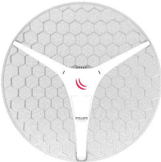
LHG XL HP5 / LHG XL 5 ac

The Light Head Grid (LHG) is a compact and light wireless device with an integrated dual polarization grid antenna at a revolutionary price. It is perfect for point to point links or for use as a CPE at longer distances. Several models are available with standard power, high power and even the XL with a higher gain and larger grid.