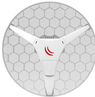
LHG HP5 / LHG 5 ac